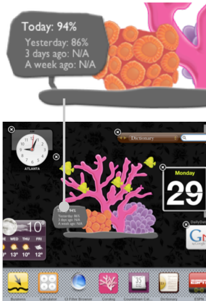
figure 1. Coralog Deployed on Dashboard

borrowing the style from scientific visualization rather than abstract or artistic expression. In contrast, ambient medium intend not to force the user to walk up to the device but rather to receive the information at a glance from a distance [3].